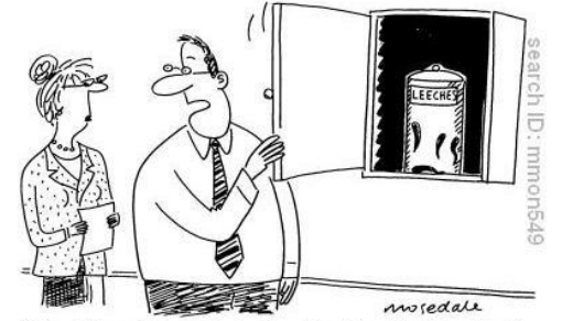
'When did you last restock the first aid cabinet Miss Tompkins?'